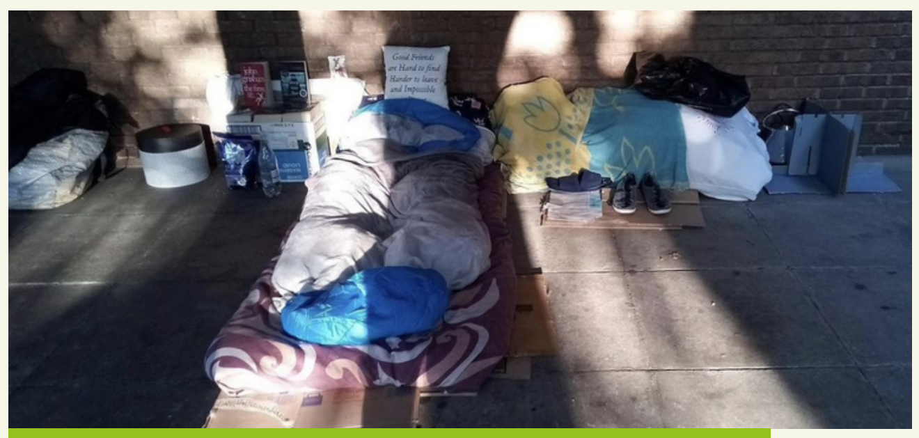
This was the sleeping site for one of our former Companions before joining Emmaus SLC.

No one should be in a situation where they are forced to rough sleep and we are proud that Emmaus is here to help people who are facing and experiencing homelessness to find a home, develop their skills, and move on.