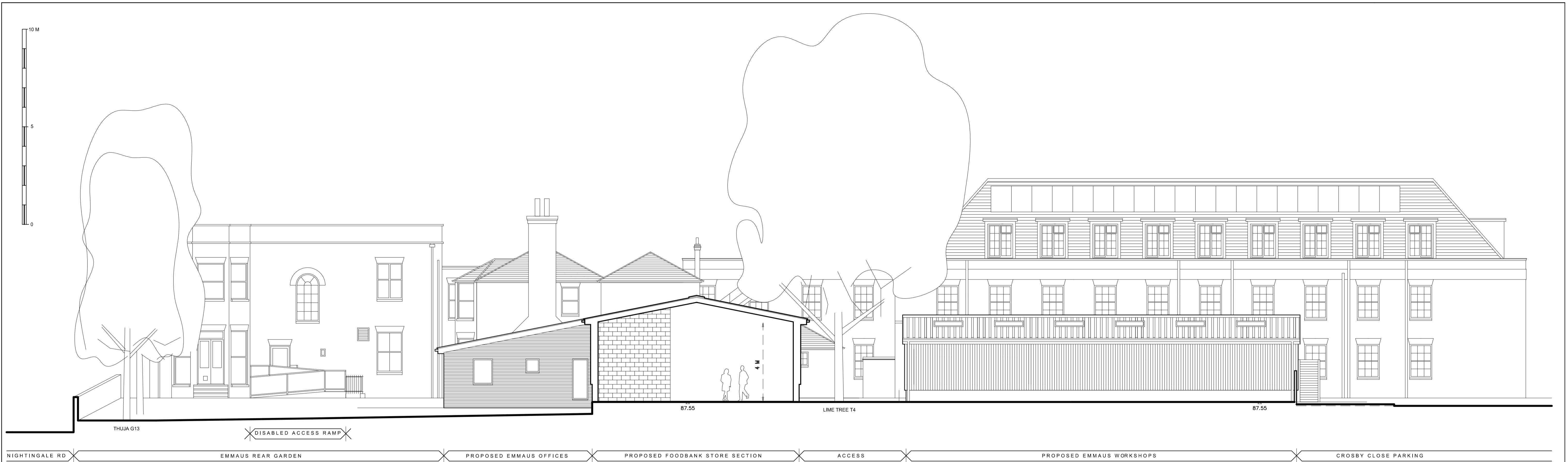
PROPOSED SOUTH EAST ELEVATION / SECTION THROUGH FOODBANK ( Site Section H-H)