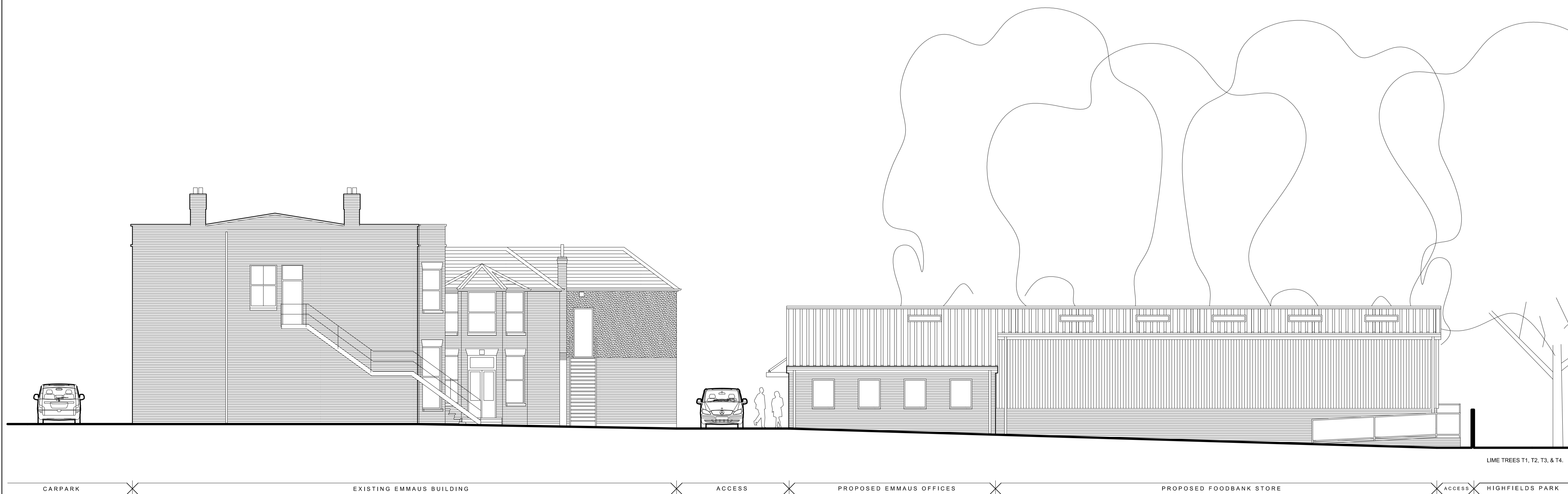
PROPOSED SOUTH WEST ELEVATION ( Site Section J-J)