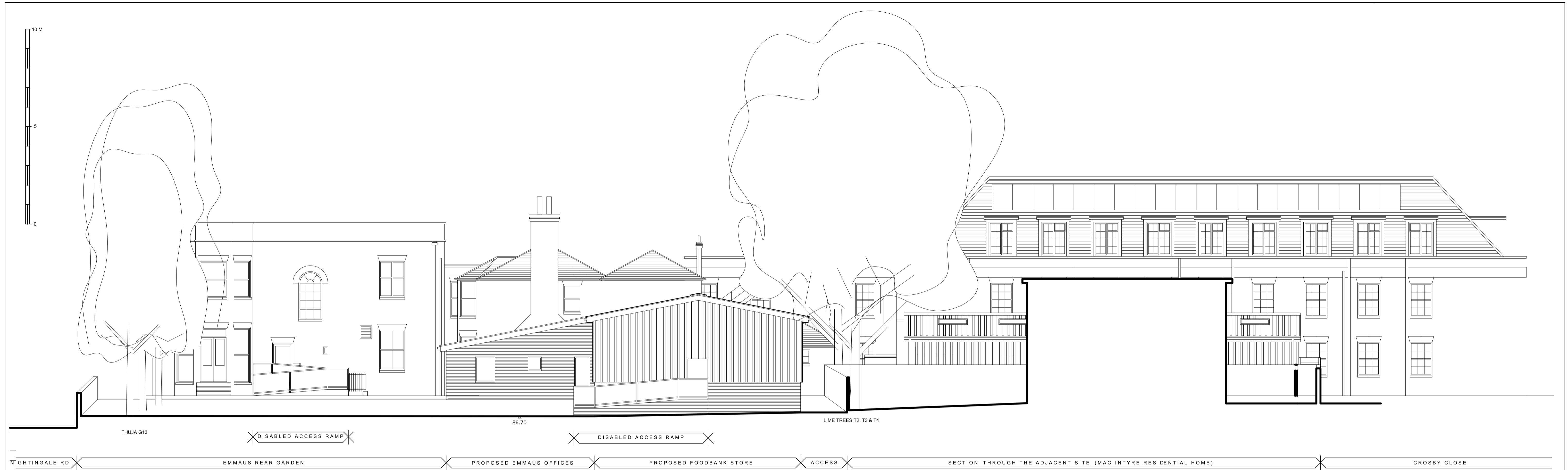
PROPOSED SOUTH EAST ELEVATION ( Site section F-F)