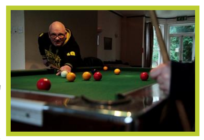
Not only does Emmaus provide occupation through the day, it aims to provide accommodation that feels like home and a support network that feels like a family

In return, Companions are expected to give back in return 40 hours of volunteering time for the second hand furniture social enterprise. Companions volunteer in our 5 shops on our vans, collecting, delivering, and renovating donated furniture. Companions also cook the meals, clean the home and maintain the Community building.