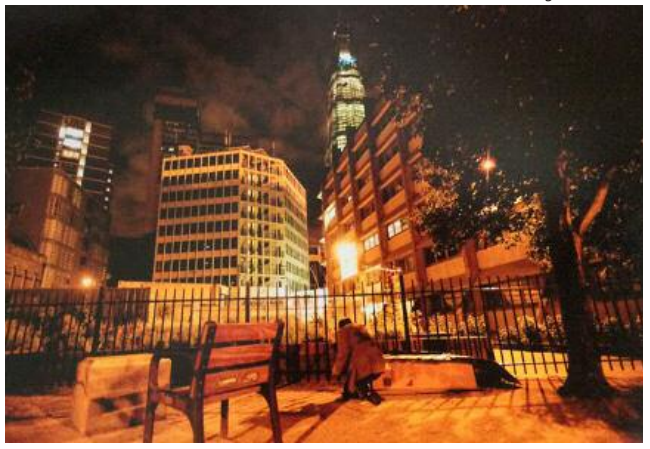
Imagine a freezing winter night with no place to call home. For many, this is their reality.