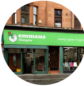
Partick charity shop 576-580 Dumbarton Road, Partick, Glasgow, G11 6RH