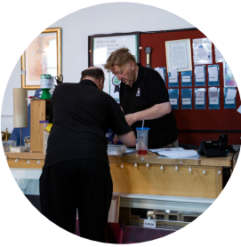
Hamiltonhill charity shop 101 Ellesmere Street, Hamiltonhill, Glasgow, G22 5QT

One easy way you can support Emmaus Glasgow is by encouraging your employees and contacts to shop and donate items at our charity shops.