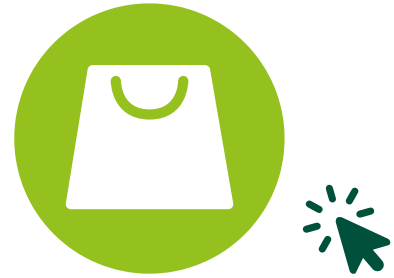
Online shop & eBay Purchase items in support of Emmaus Glasgow 24/7 from our online shop and charity eBay store.